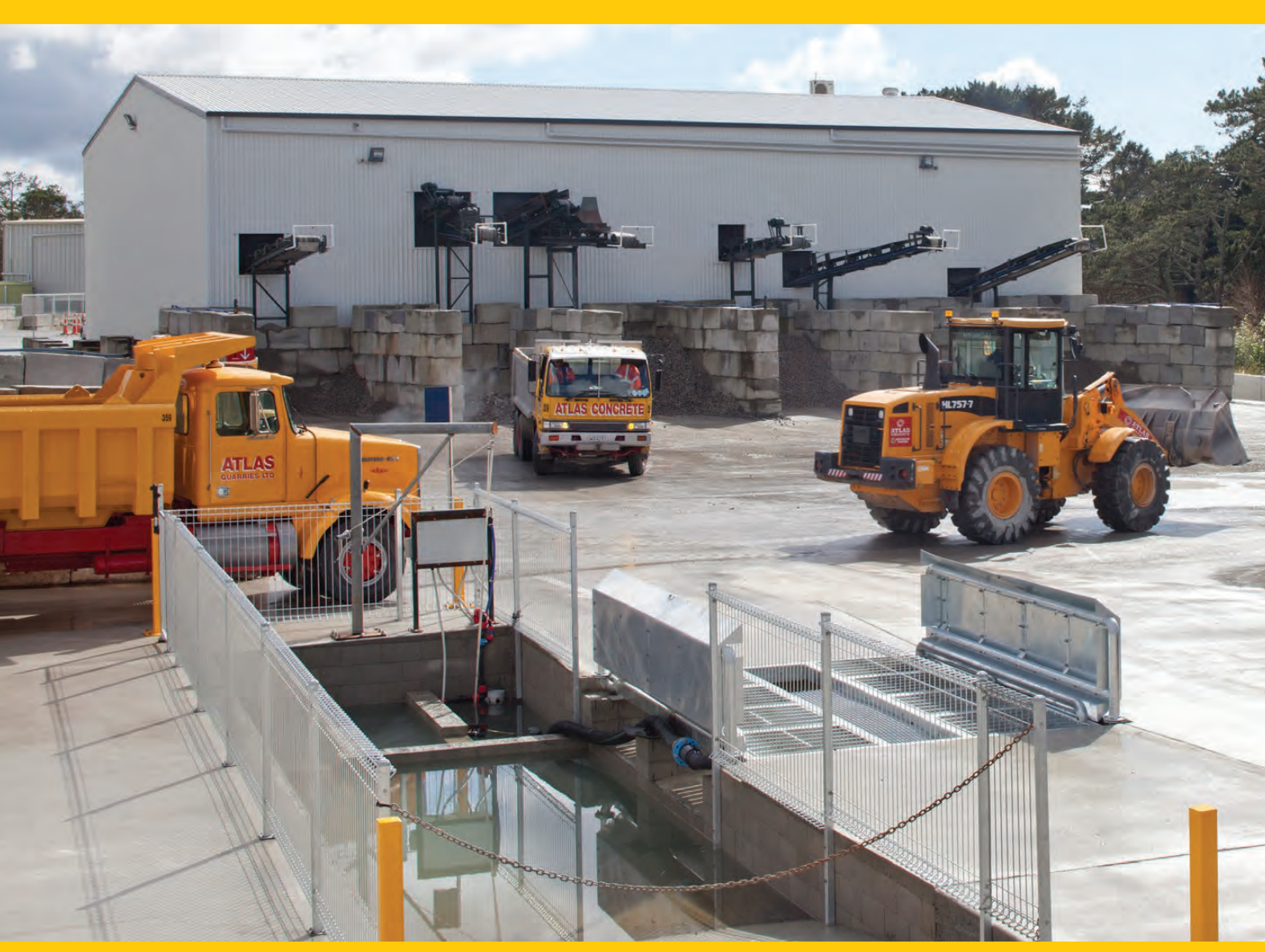
SUPERIOR QUALITY AT ALL GRADES